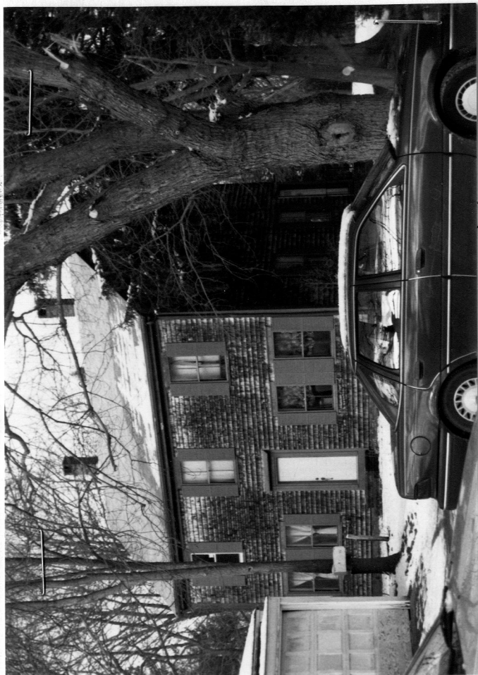
inventoried building. Indicate north.

Massachusetts Historical Commission 220 Morrissey Blvd. Boston, Massachusetts 02125