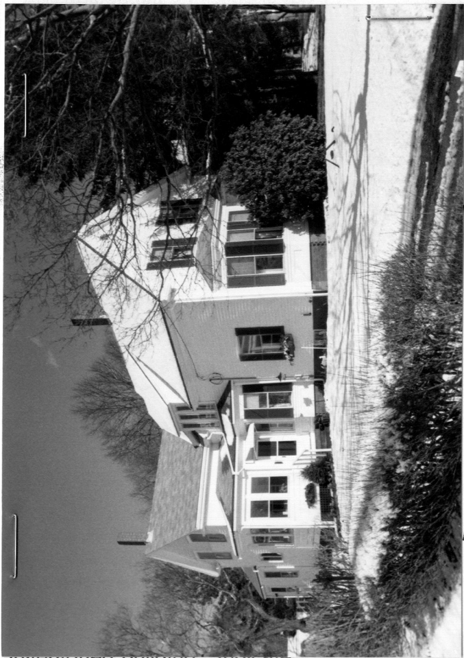
Inverted building. Indicate north.

Massachusetts Historical Commission 220 Morrissey Blvd. Boston, Massachusetts 02125