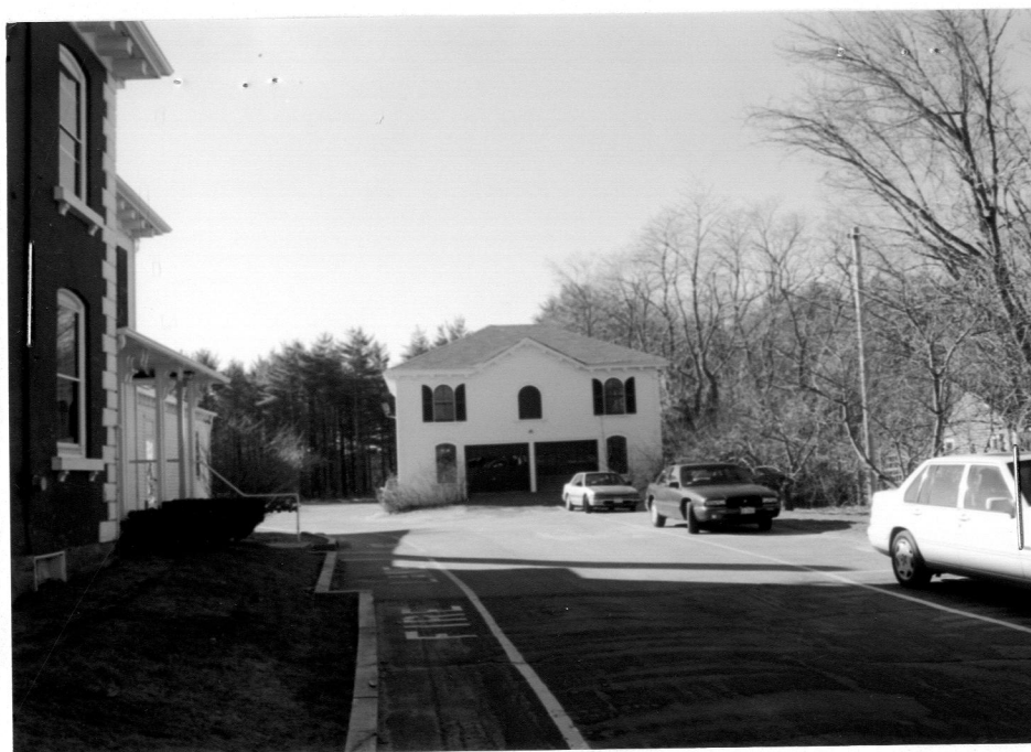
Barn (KIN. 407)