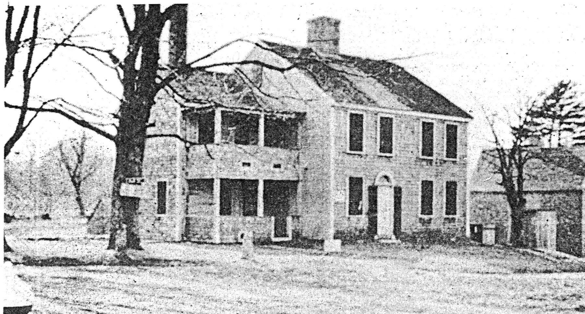
4 Sylvia Place c. 1915