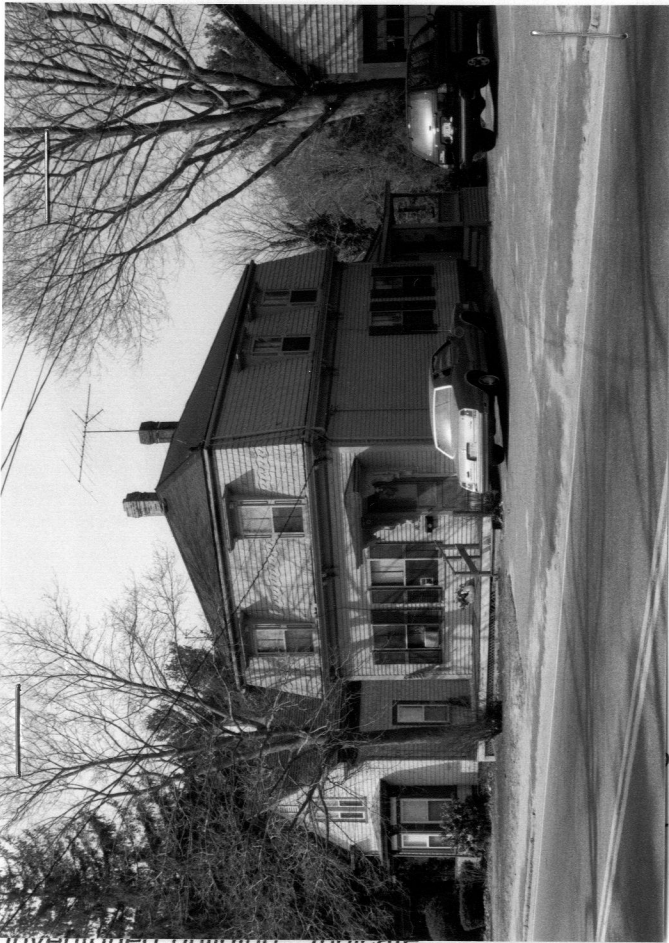
Inventoried building. Indicate north.

Massachusetts Historical Commission 220 Morrissey Blvd. Boston, Massachusetts 02125