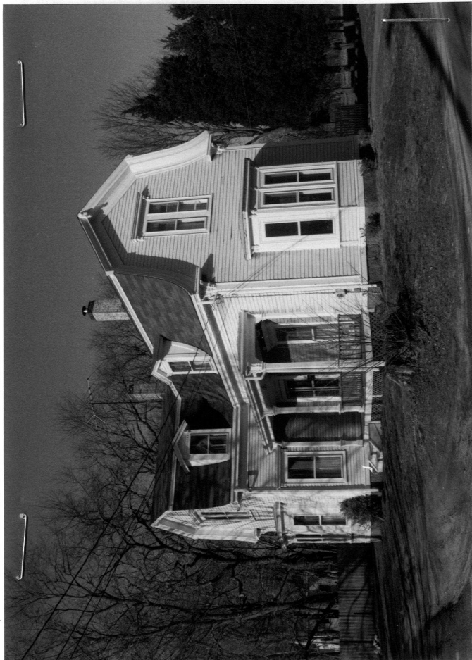
inverted building. indicate north.

Massachusetts Historical Commission 220 Morrissey Blvd. Boston, Massachusetts 02125