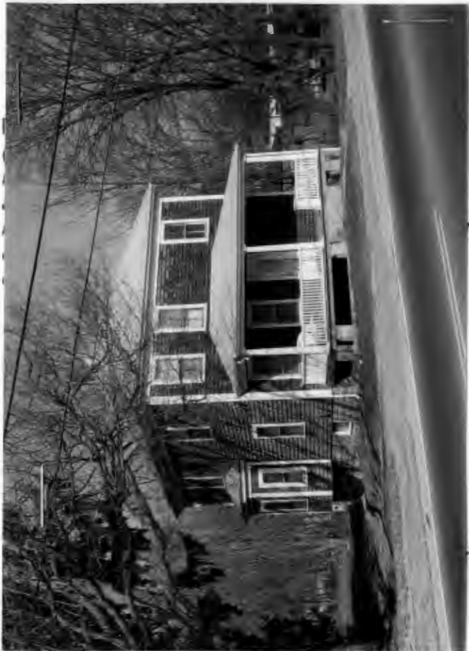
numbers, inventory north.

Massachusetts Historical Commission 220 Morrissey Blvd. Boston, Massachusetts 02125