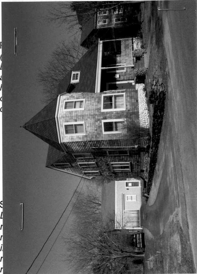
inventoried building. Indicate north.