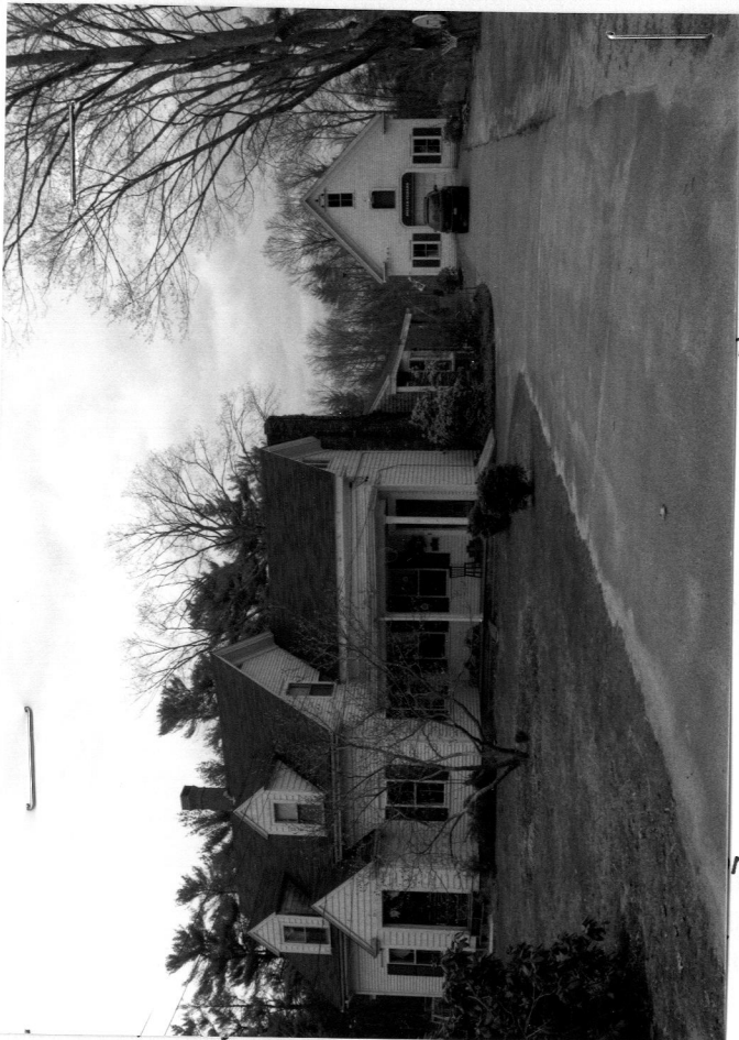
inventoried building. Indicate north.