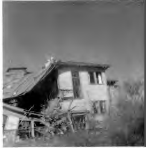
5/4/2004 244 Main St. Kingston High School Demolition 244 Main St 2_edited.jpg