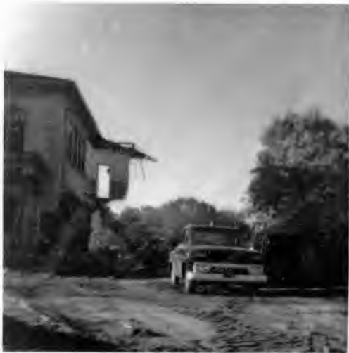
5/4/2004 244 Main St. Kingston High School Demolition 244 Main St 4_edited.jpg