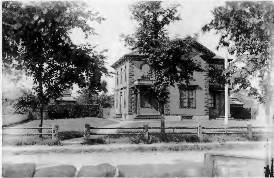
11/9/2003 244 Main St. Kingston High School 244 Main St 7.jpg