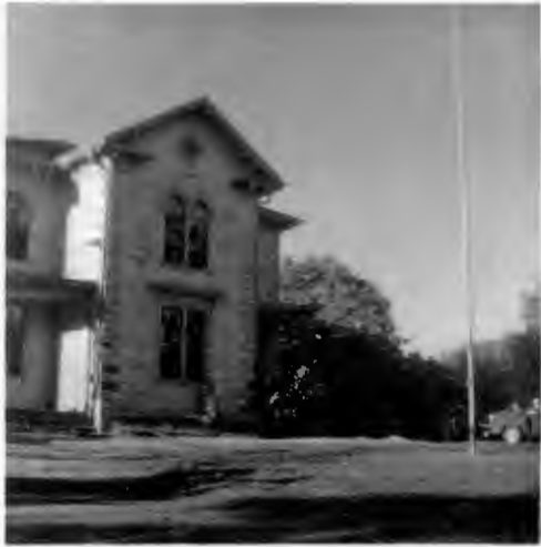
5/4/2004 244 Main St. Kingston High School Demolition 244 Main St 1_edited.jpg