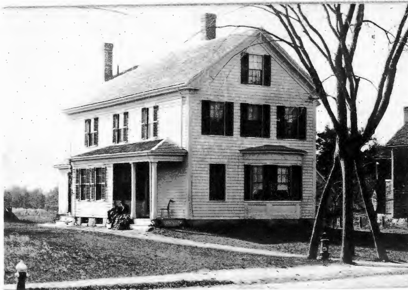
256 Main St.