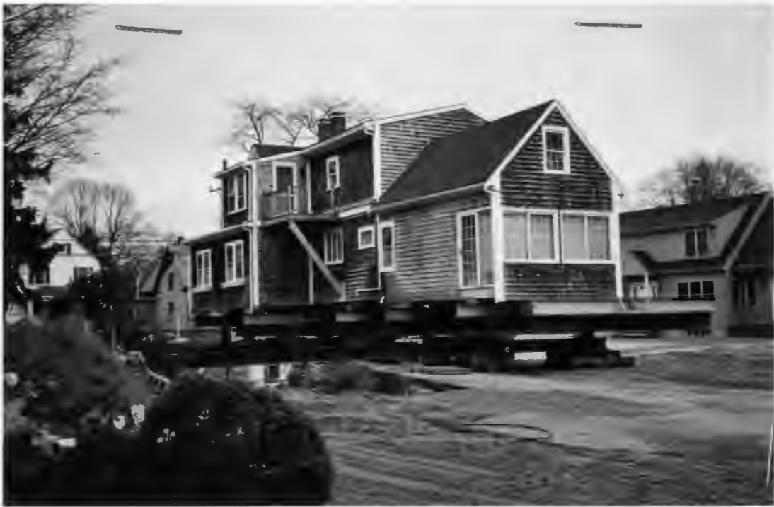
KIN. 483 - NOW AT 159 PEMBROKE ST.