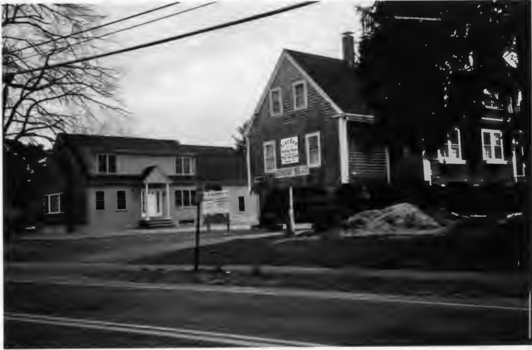
Left: KIN. 454