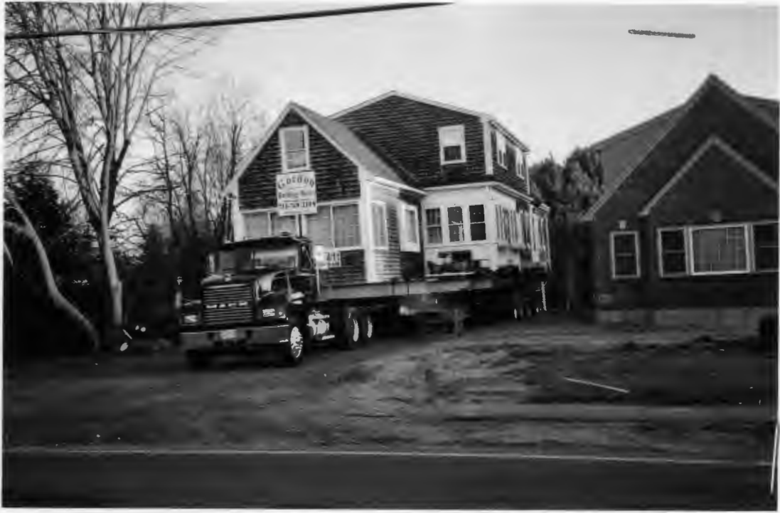
Left: KIN. 483 - NOW at 159 PEMBROKE ST. ↕ Right: KIN. 454 - 266 MAIN ST.