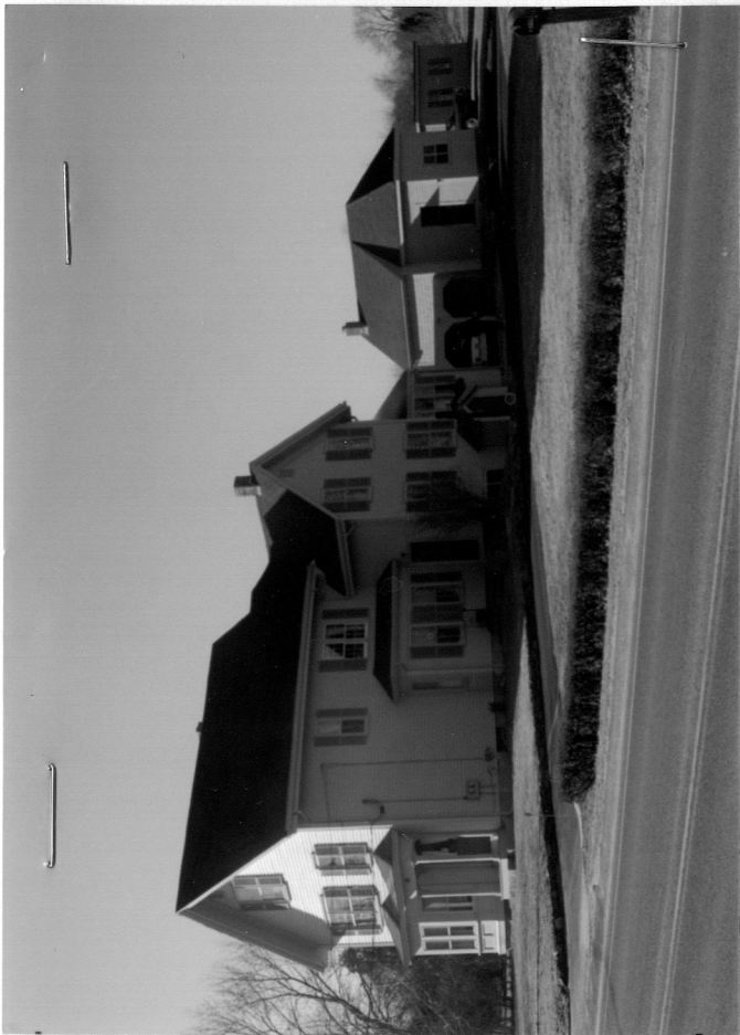
inventoried building. Indicate north.