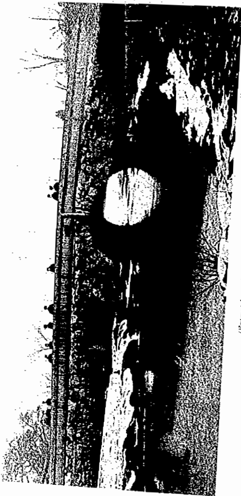
Extract from the Town Records of the year 1801. Voted to choose a committee of five persons to take a view of the Great Bridge and report to the Town whether said Bridge will answer to repair or to rebuild it or whether with stone.