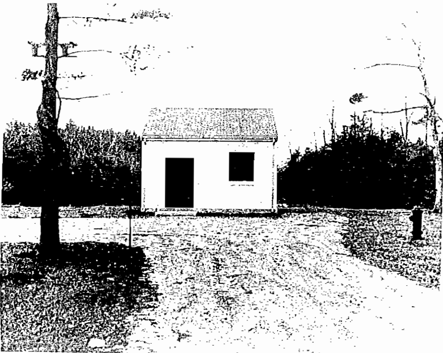
NEW PUMP HOUSE BUILT IN 1961 ON WINTHROP STREET