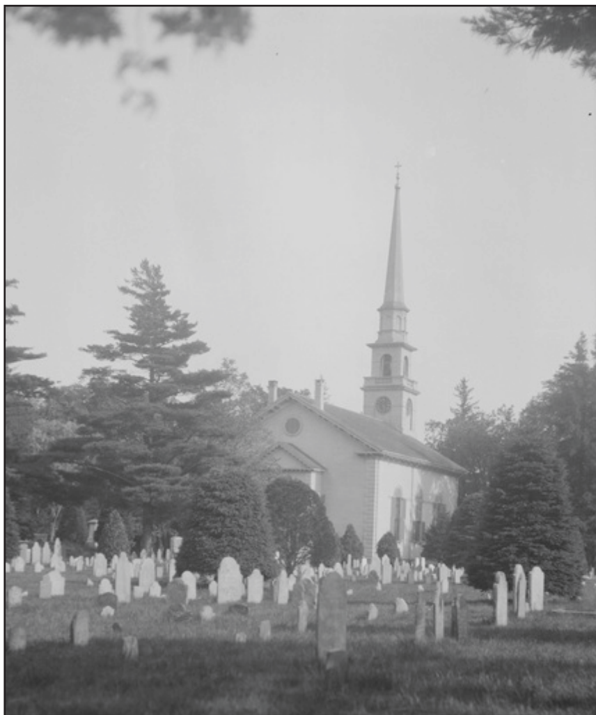
The Old Burying Ground and First Parish Church in Kingston, Massachusetts c. 1925